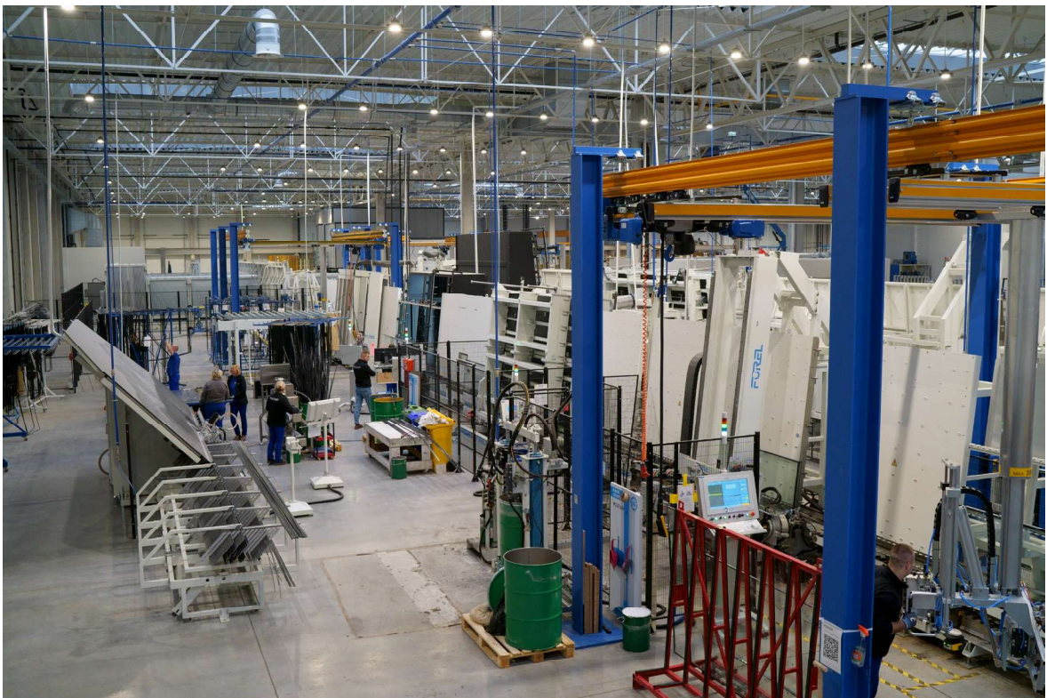
The production plant of POLFLAM®